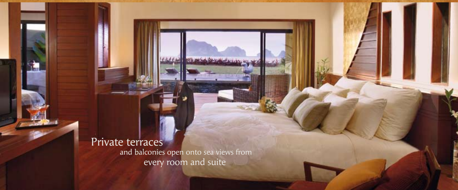
Private terraces and balconies open onto sea views from every room and suite